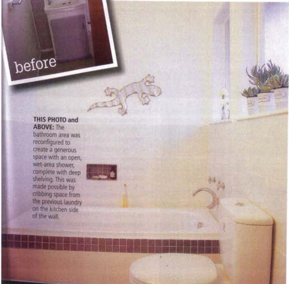
THIS PHOTO and ABOVE: The bathroom area was reconfigured to create a generous space with an open, wet-area shower, complete with deep shelving. This was made possible by cribbing space from the previous laundry on the kitchen side of the wall.